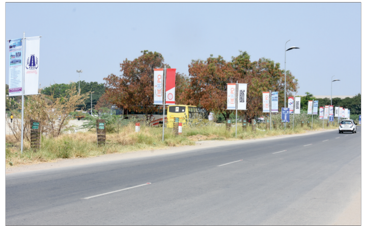
Buntings Outside the venue Size : 2ft x 6 ft