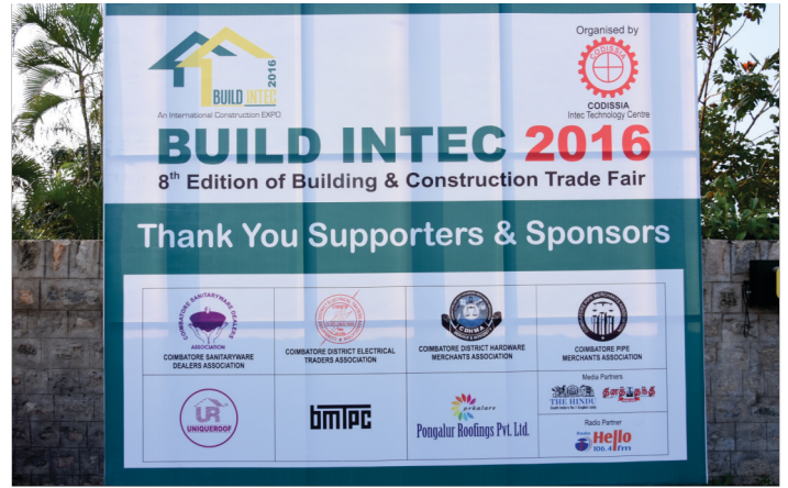
Exclusive Branding for Sponsors & Supporters