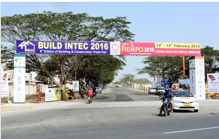
Main Road - ENTRY ARCH Size 5ft x 75ft