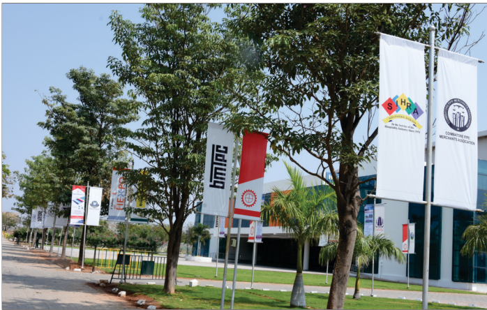
Buntings inside the venue Size : 2ft x 6 ft