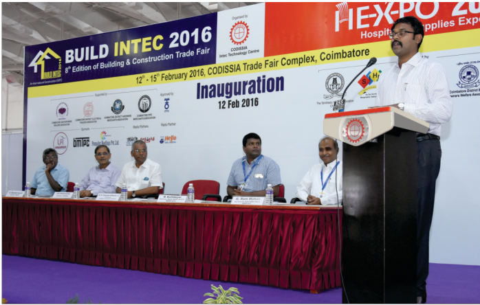
Branding in Inauguration Backdrop